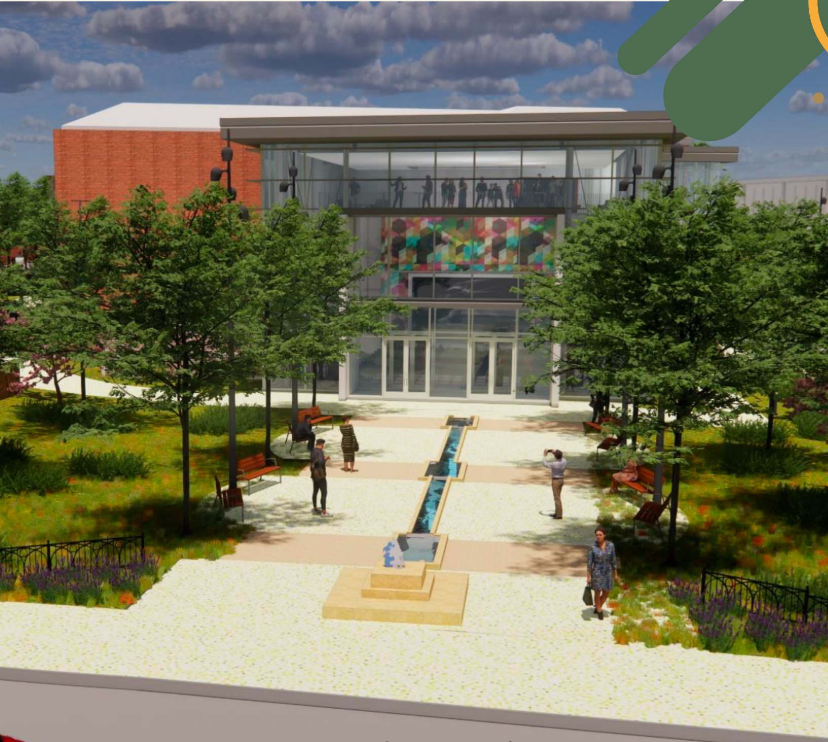
Dothan Opera House from Main St.